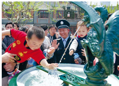
The dedication of a Basel basilisk fountain in Shanghai's Butterfly Bay Park in April 2009.