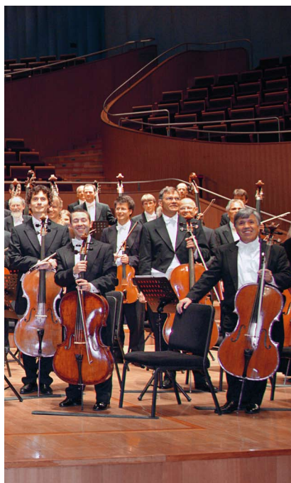
Concert by the Basel Symphony Orchestra on 11 August 2010 at the Shanghai Oriental Art Center.