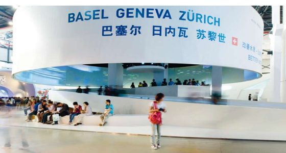
The Basel, Geneva and Zurich city pavilion at the World Expo 2010 in Shanghai.

Basel’s appearance at the World Expo 2010 Shanghai represented the beacon project of the Basel-Shanghai cities partnership. From the beginning of May until the end of October 2010, under the motto “Better Water – Best Urban Life”, the Basel, Geneva and Zurich city pavilion demonstrated the contribution that investments in sustainable water management can make to an extraordinarily high urban quality of life to over two million visitors.